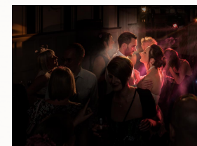
First Dance, in a World of their own.

This package includes all of the coverage and digital elements of the Digital Package; additionally there is an album set for you and both sets of parents. The Albums are hand-finished in Italy and come in a beautiful box and can be covered in a variety of materials including patent leather. You decide, you design, exactly what you want.