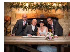
Inside a dark barn lit by candles.

Sometimes I am asked to photograph simple, midweek ceremonies where the client only wants around twenty photographs. This all takes place, typically, at one venue and lasts a couple of hours. The Pictures are provided on a CD with rights to copy and print. Winter and midweek weddings are negotiable.