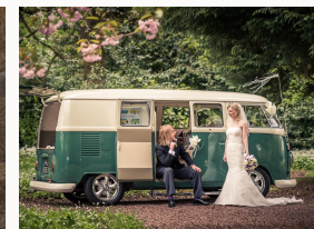
A beautiful old VW Campervan.