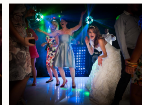
Spotted by the bride, no ninja badge for me. :)